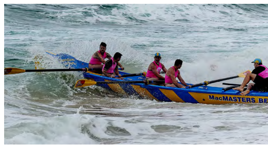
MacMasters Beach SLSC | Point Break Newsletter | November 2024 | www.macmastersbeachslsc.com.au