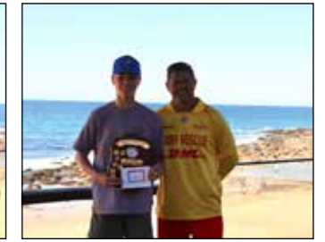
Water Sports Achievement Award