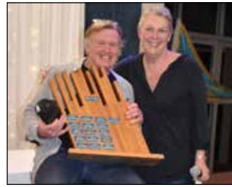
Bar Fly Award