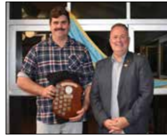
Patrol Person Award