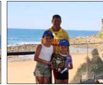
Mark Sherring Future Achiever Award