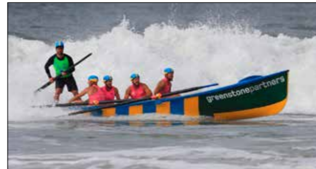
The Fat Dads