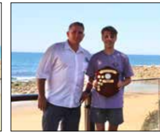
Board Coach Award