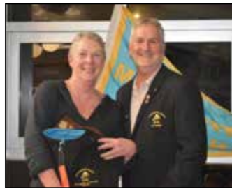
Club Worker of the Year