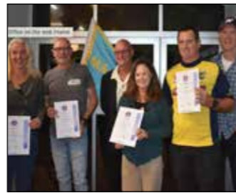
National Patrol Service