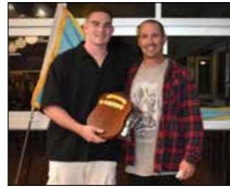
Boaties Boatie Award