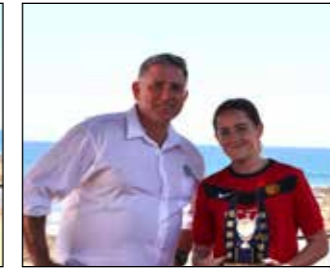
Sports Person Award