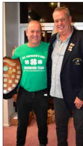
Club Person of the Year