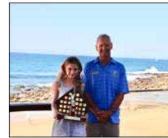
Beach Sports Achievement Award