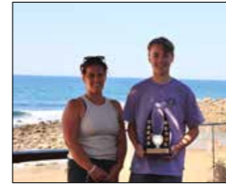
Carnival Competitor Award