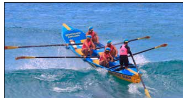
The Fat Dads