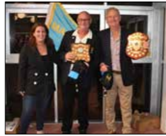
Point Score - Board and Swim