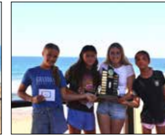
Team of the Year