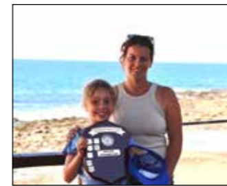
Water Sports Encouragement Award