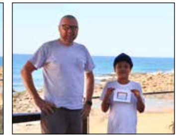
Board Encouragement Award