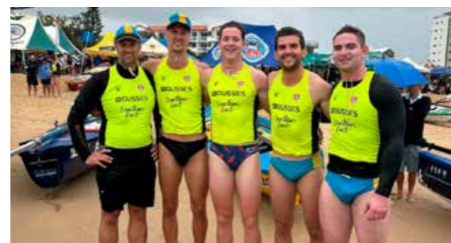
The A Crew