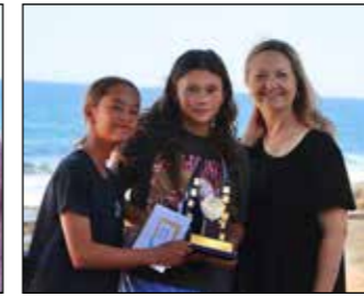
Sports Achievement Award