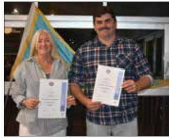
Advanced Resus Certificate