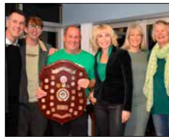
Patrol of the Year