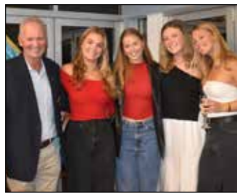
Team of the Year