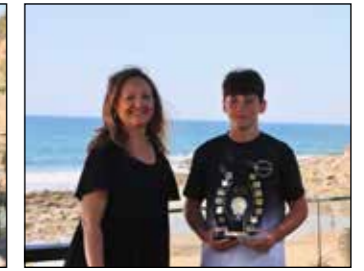
Most Improved Award