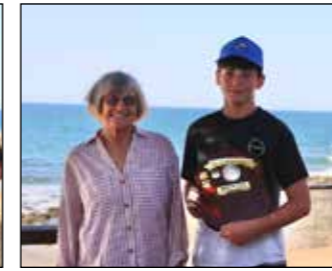
Alec Lee March Past Award