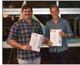
Silver Medallion IRB Driver