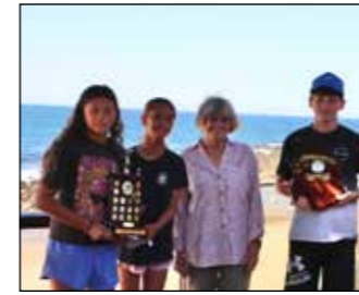
March Past and R&R Award