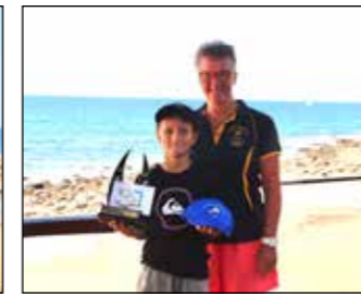
Beach Sports Encouragement Award