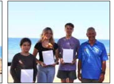
Long Service Awards