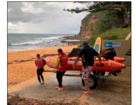
IRB training Jim