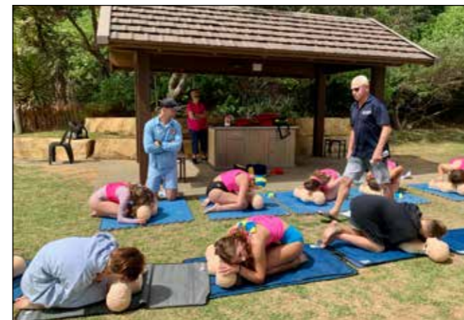
Rookies practising CPR