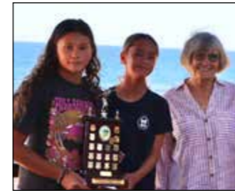
Rescue & Resuscitation Award