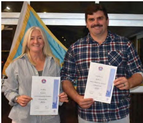
Advanced Resuscitation Award