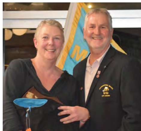
Club Worker of the Year