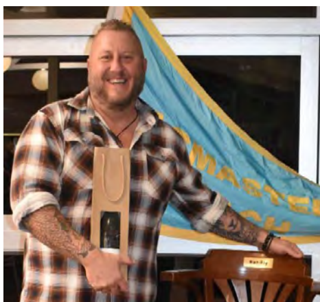
Bar - Outstanding Newbie Award

Celebrating champions community and connection Mac's Beach SLSC