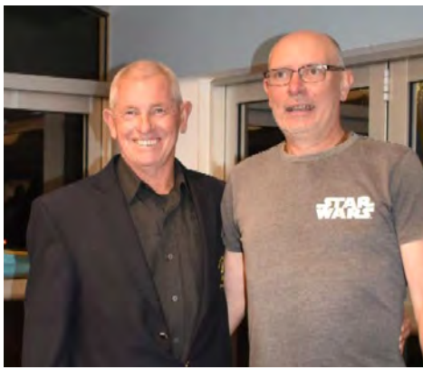
2023/24 Recognition Award