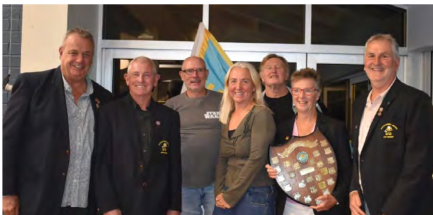
Club Encouragement Award - Education Team