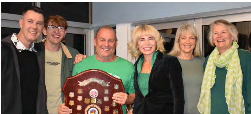
Patrol of the Year - Patrol 4