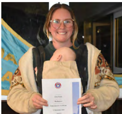
Radio Operator Award