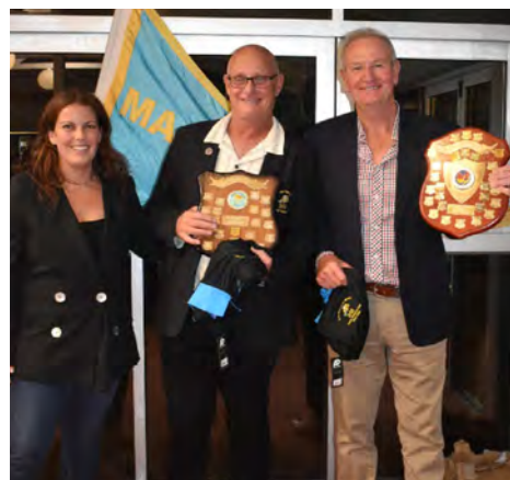
Point Score Champions - Board and Swim