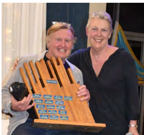
Bar Fly Award