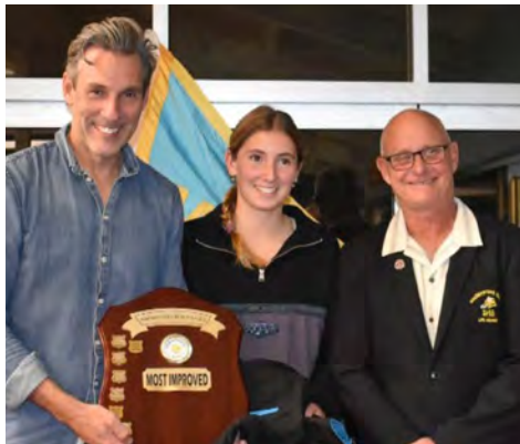
Most Improved Lifesaver Award recipients