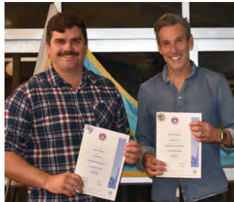
IRB Driver - Silver Medallion Award