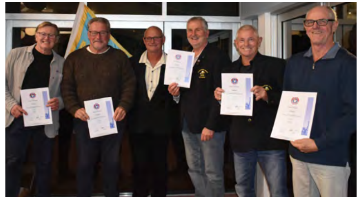
20 to 25 Year Patrol Service Awards