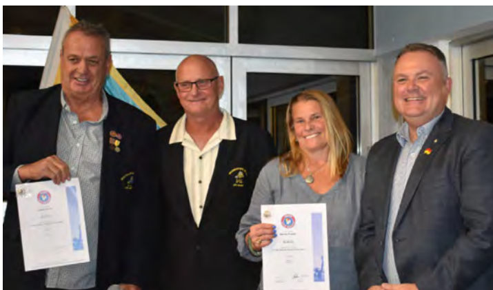
Patrol Service Award recipients: