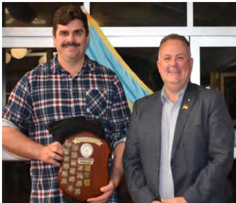
Patrol Person of the Year Award

Mac's Beach SLSC 6204.77 patrol hours 74,135 total attendance 30 rescues performed 2464 preventative actions