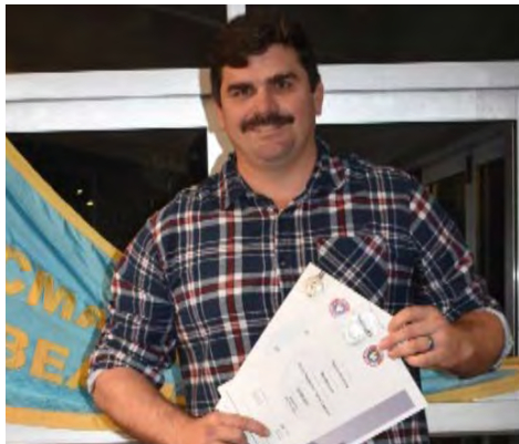
Silver Medallion Award