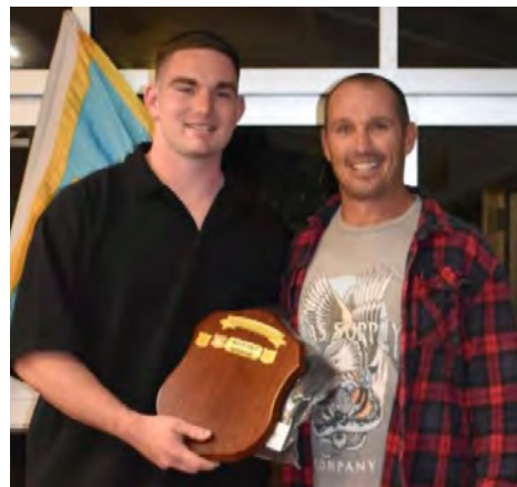
Surf Boats - Boaties Boatie Award