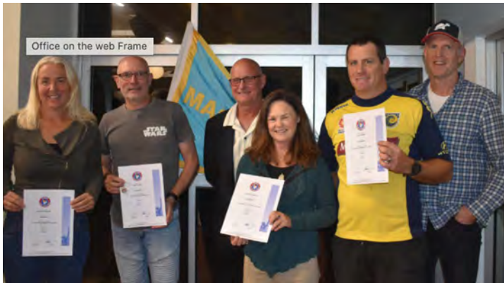
5 to 15 Year Patrol Service Awards