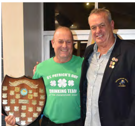
Club Person of the Year