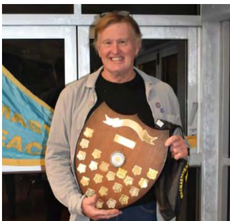
Age Champion - Open Male