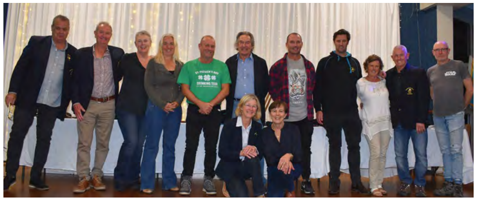
Recognition of contribution: Many people are constantly working away in the background contributing to the activities and functions of the Club.