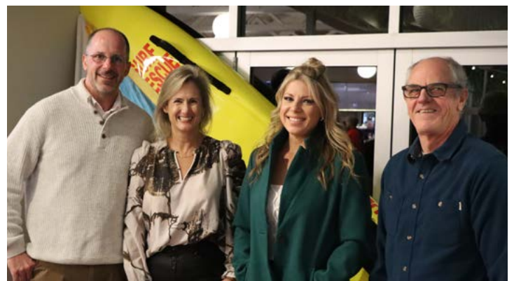
Provide Advanced Resuscitation Certificates