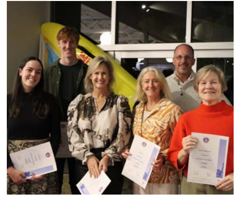
Radio Operator awardees