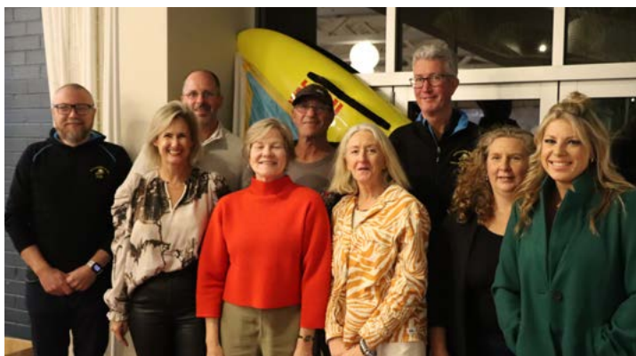
Provide First Aid recipients