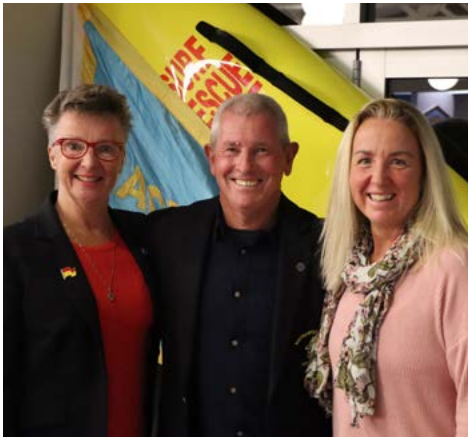
Training Officer Certificate awardees