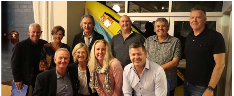
Recognition of contribution: Many people are constantly working away in the background contributing to the activities and functions of the Club.