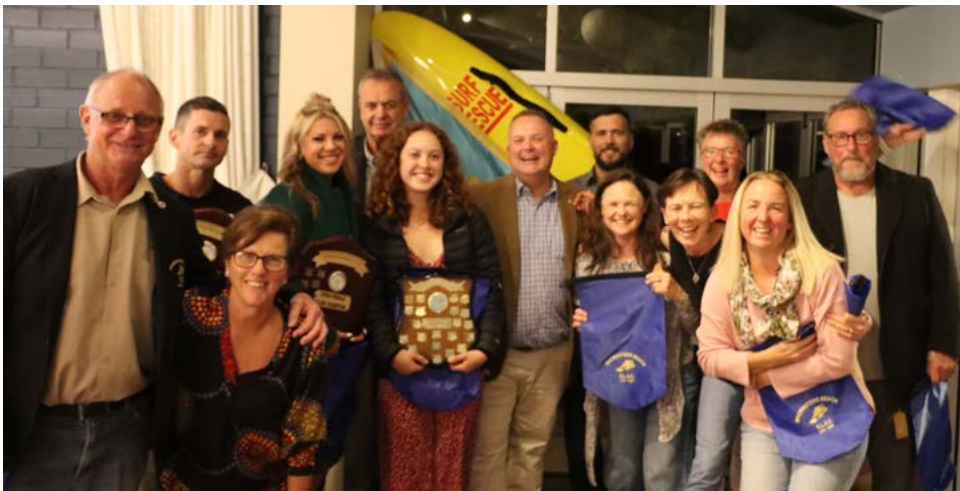
Mac's Senior and Masters Club Champions!