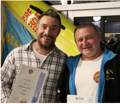
Silver Medallion recipients