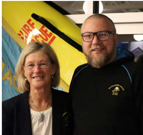
Mental Health Certificate awardees

Mac's Beach SLSC retrained + requalified 267 individuals in 2022/23 across a wide range of essential skills for surf life saving!