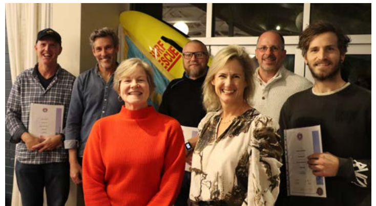
Bronze Medallion recipients