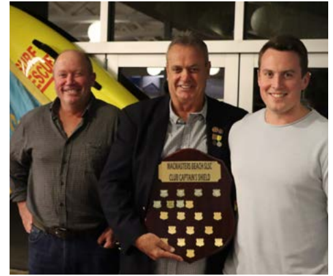
Club Captains Award & Patrol of the Year: Patrol 3