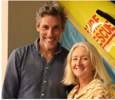
IRB Crew awardees