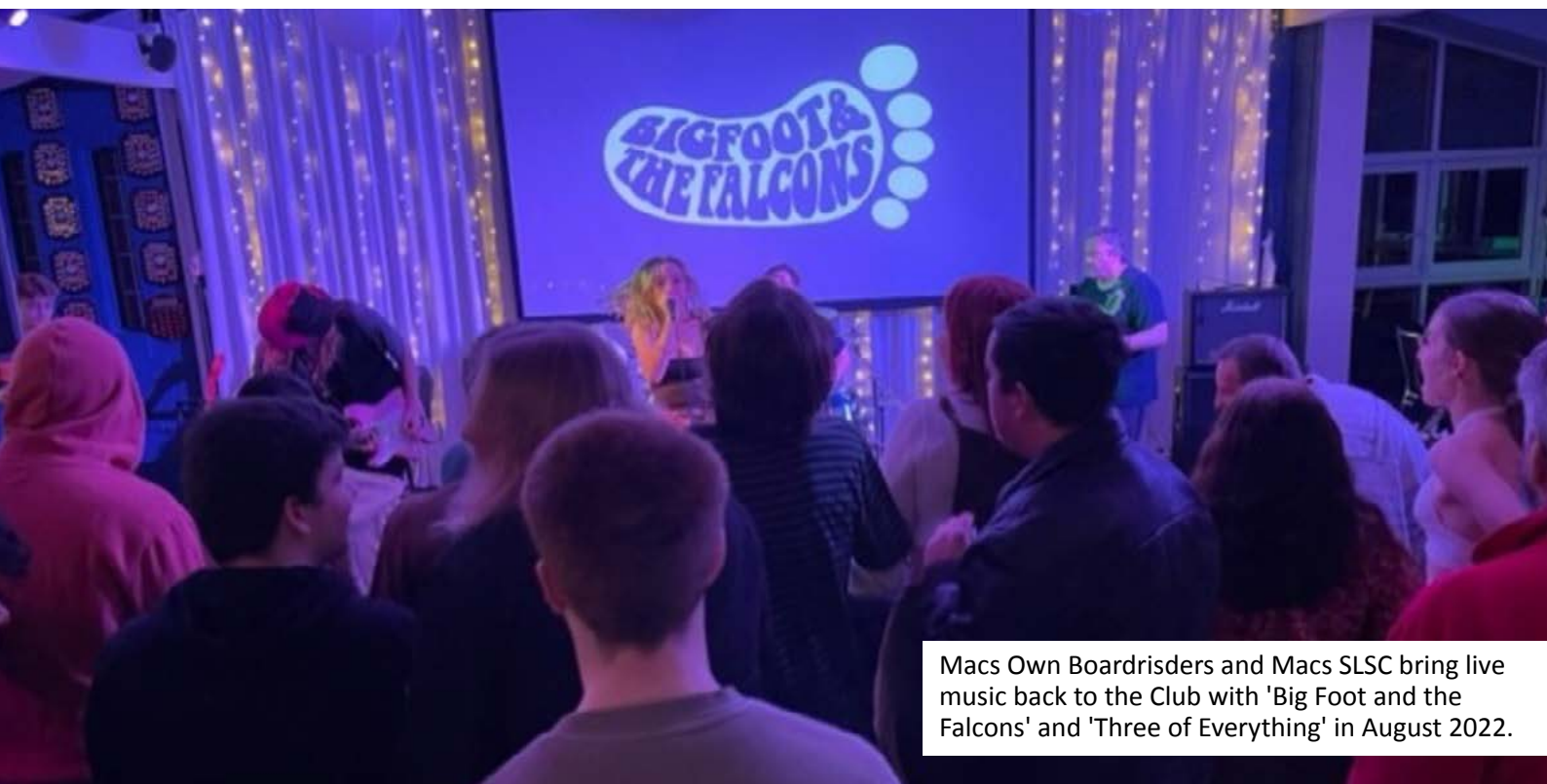
Macs Own Boardriders and Macs SLSC bring live music back to the Club with 'Big Foot and the Falcons' and 'Three of Everything' in August 2022.