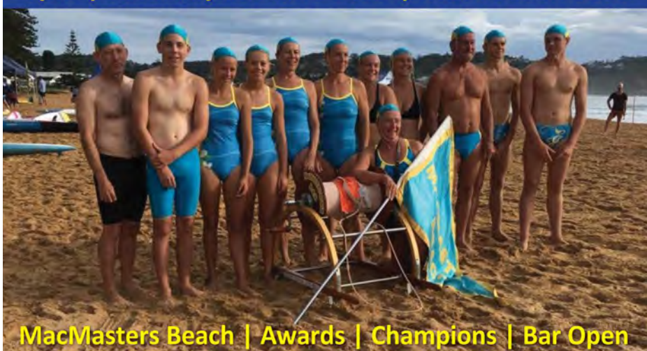
MacMasters Beach | Awards | Champions | Bar Open