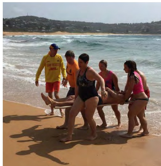
Macmasters Beach Surf Club Education/Training Program 2018/2019 Season

For bookings and more information on the courses and training opportunities contact Jono on 0411 184 642.