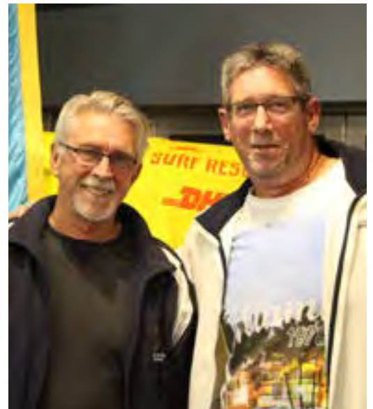
NATIONAL PATROL SERVICE - 20 YEARS ^