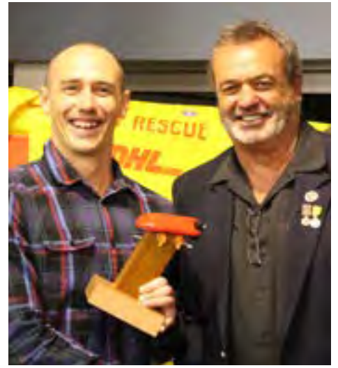
IRB FLIPPER AWARD ^

Celebrating our achievements and qualifications