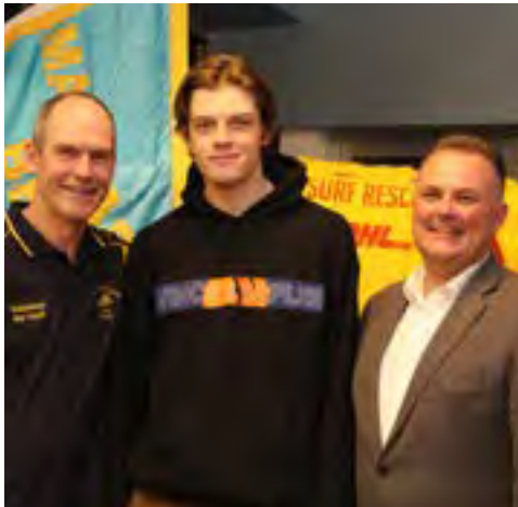
^ DUKE OF EDINBURGH GOLD AWARD