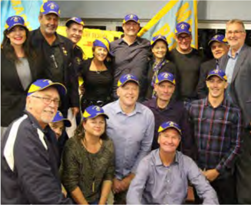
^ PRESIDENT'S AWARDS