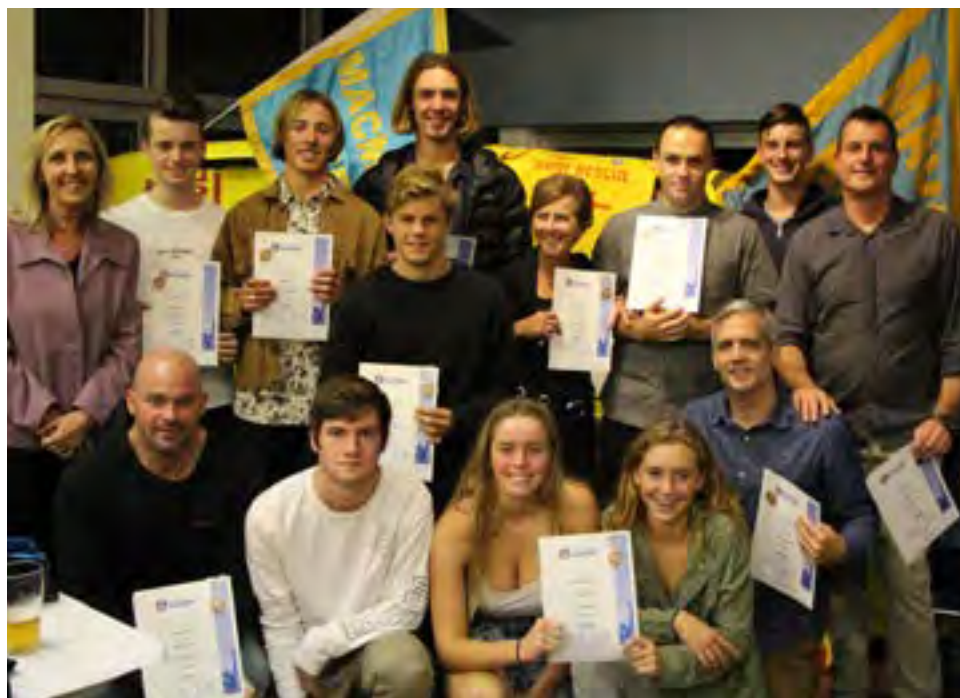
^ BRONZE MEDALLION QUALIFICATION