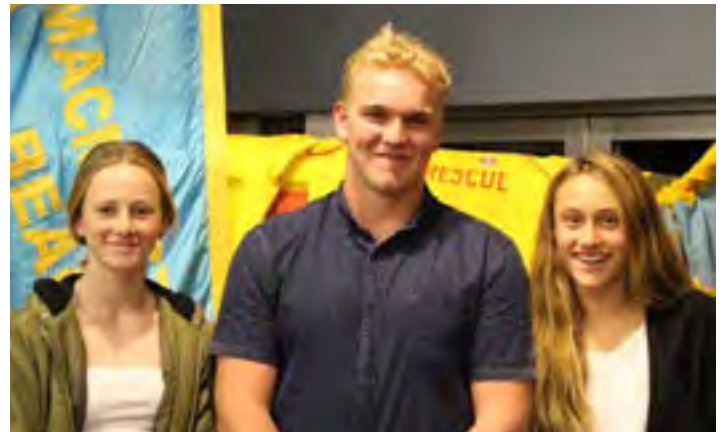
AUSSIE TITLES: U15 & U17 Medalists ^