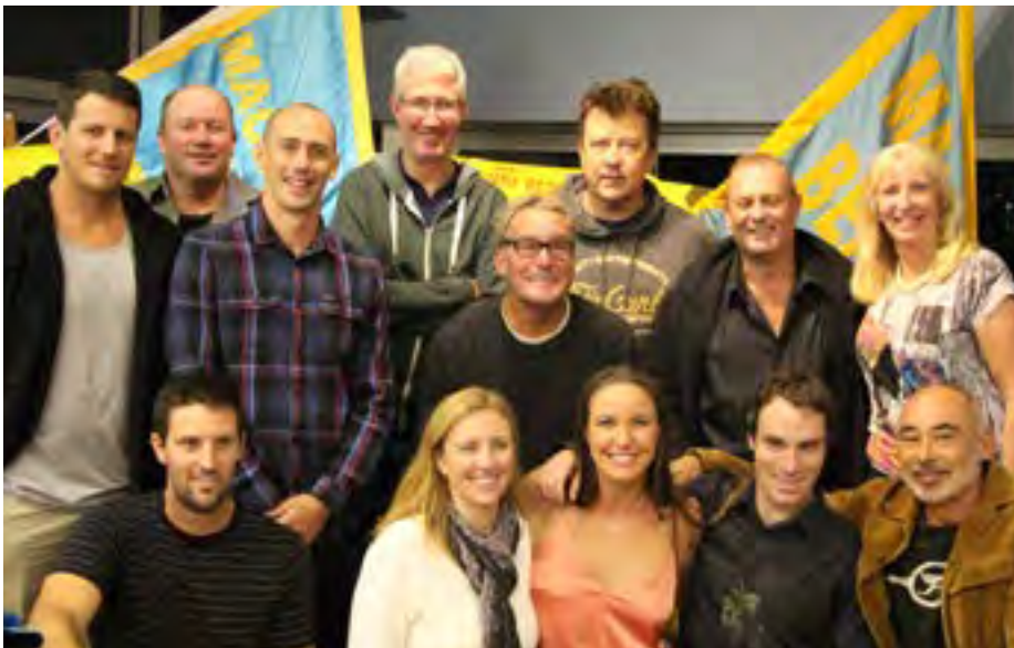
^ NATIONAL PATROL SERVICE - 10 YEARS