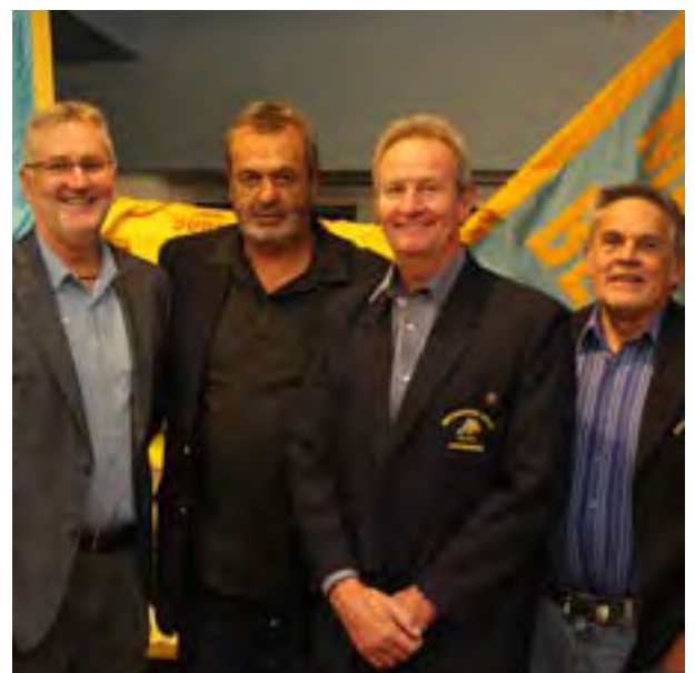
NATIONAL PATROL SERVICE - 25 YEARS ^