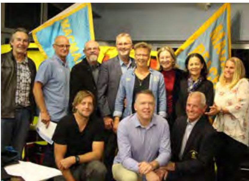
^ NATIONAL PATROL SERVICE - 15 YEARS: