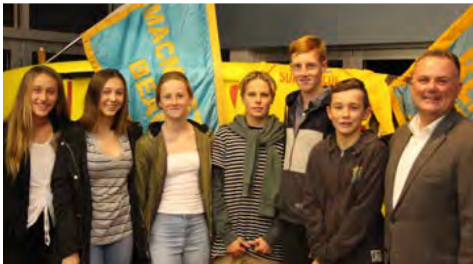
^ ROOKIE PROGRAM: