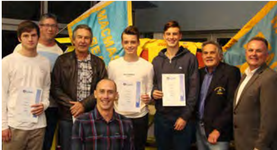
^ IRB CREW QUALIFICATION