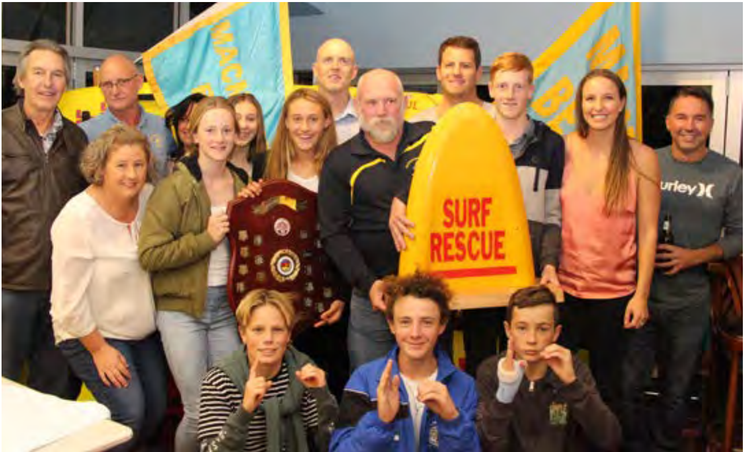
^ PATROL OF THE YEAR: Patrol 10!