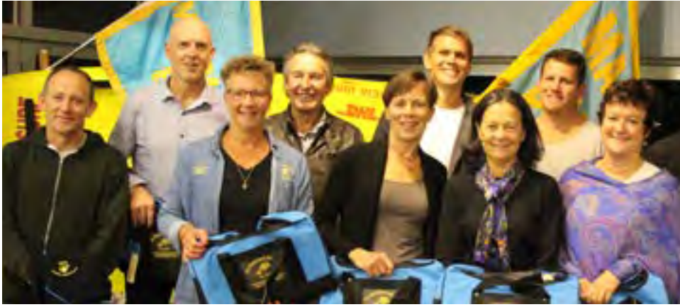
^ MACS MASTERS