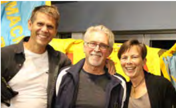
^ MACS POINT SCORE: Angus (Bd) + Val (Sw)