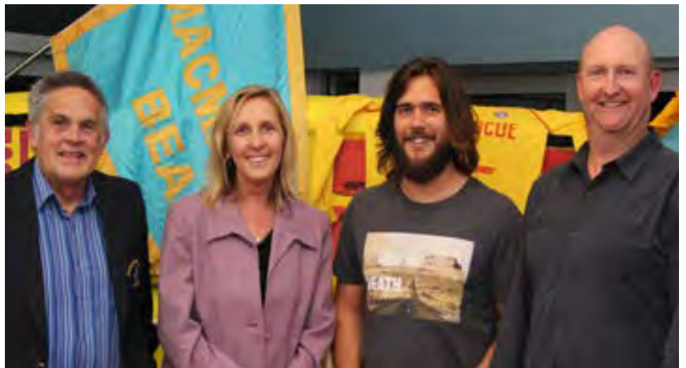
IRB SILVER MEDALLION QUALIFICATION ^

Celebrating our achievements and qualifications