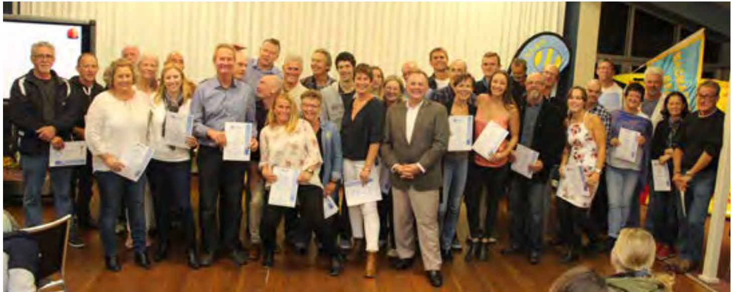
^ ADVANCED RESUSCITATION TECHNIQUES