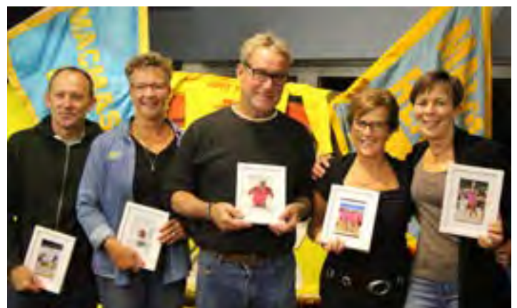
AUSSIE TITLES: Macs Masters Competitors ^