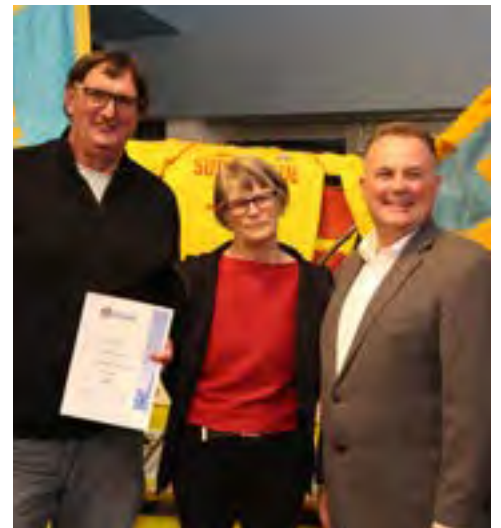
RADIO OPERATOR ^ CERTIFICATE