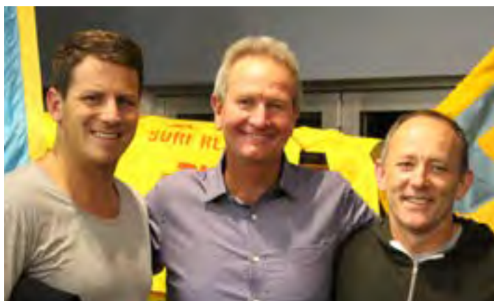
^ AUSSIE TITLES: Macs Masters Medalists