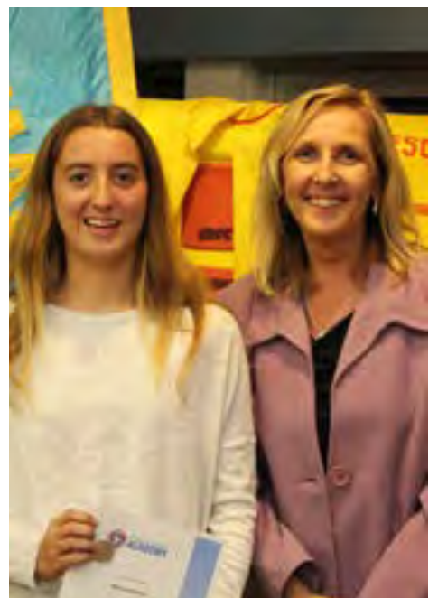
SILVER MEDALLION ^ QUALIFICATION