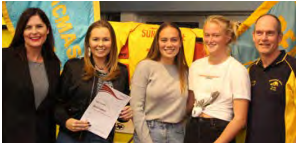
DUKE OF EDINBURGH BRONZE AND SILVER AWARDS ^