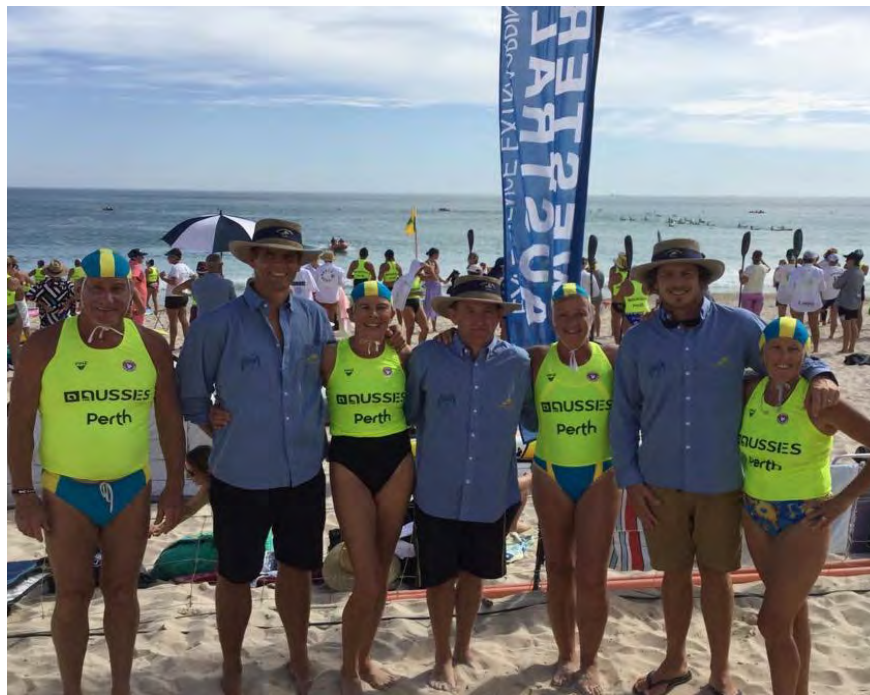
ABOVE: Macs Masters competitors wearing their shirts proudly at Aussies in WA