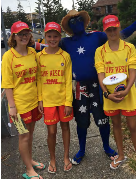
MacMasters Beach SLSC | Point Break Newsletter | February 2018 | www.macmastersbeachslsc.com.au