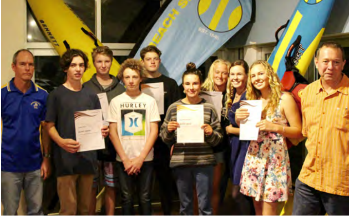
2017 Duke of Edinburgh Program recipients