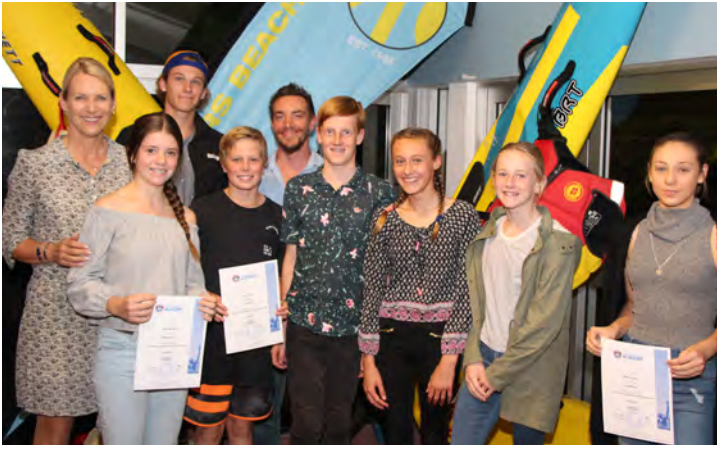
2017 Surf Rescue Certificate recipients