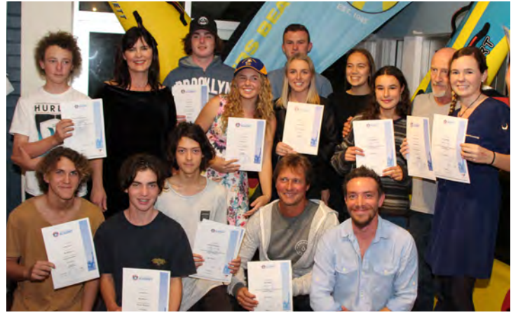
2017 Bronze Medallion awardees